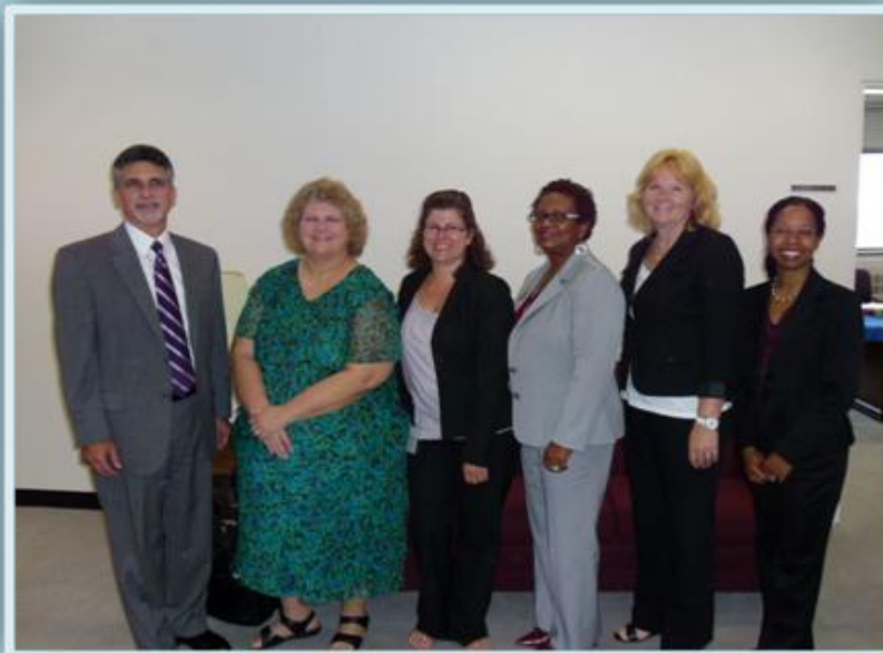
THE SUCCESS TEAMS

Comments on the above as well as additional comments and suggestions welcomed at thebridge@hud.gov