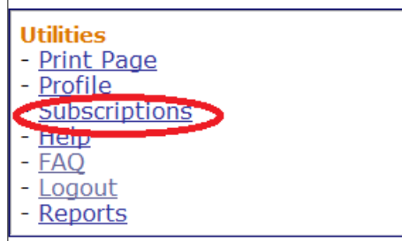
Figure 1: Email Subscription Link

Users access the email subscription via the “Subscriptions” link under the “Utilities” menu option.