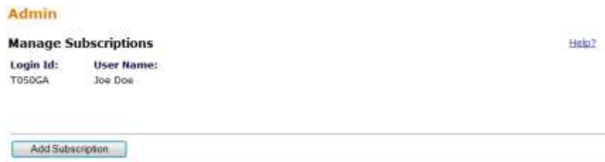
Figure 2: Manage Subscriptions

On selection of the link, the Manage Subscriptions page is displayed.