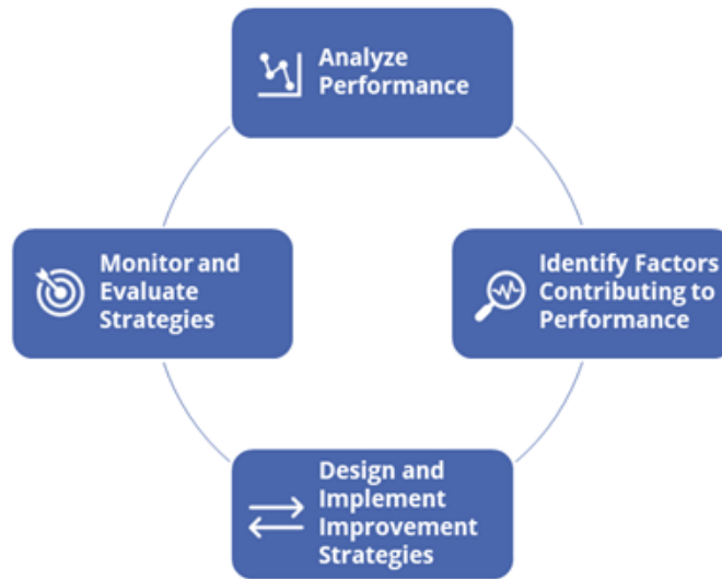
Figure 1: Performance Analysis and Improvement Process

This toolkit is designed to support Continuums of Care (CoCs) to become more outcome-oriented and data-informed. It is centered around the Performance Analysis and Improvement Process , which helps CoCs move data into action through a cycle of analyzing performance, identifying contributing factors, designing improvement strategies, and evaluating impact within a continuous quality improvement framework.