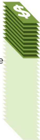
U.S. Population: Urban, Suburban, and Rural