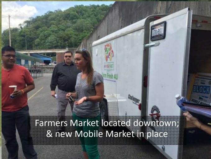
Farmers Market located downtown; & new Mobile Market in place