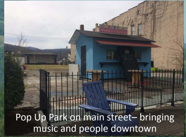
Pop Up Park on main street– bringing music and people downtown