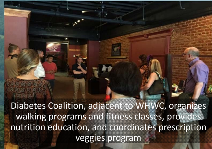
Diabetes Coalition, adjacent to WHWC, organizes walking programs and fitness classes, provides nutrition education, and coordinates prescription veggies program