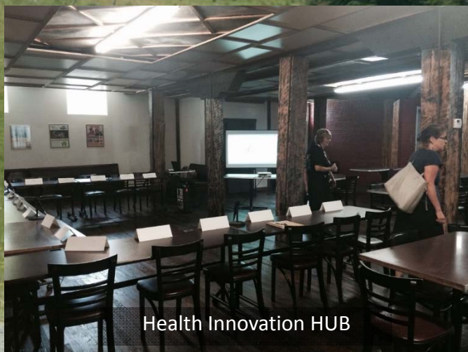
Health Innovation HUB