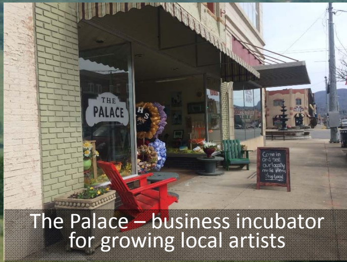
The Palace – business incubator for growing local artists