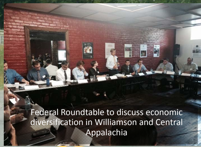
Federal Roundtable to discuss economic diversification in Williamson and Central Appalachia