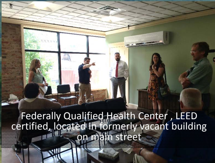
Federally Qualified Health Center , LEED certified, located in formerly vacant building on main street