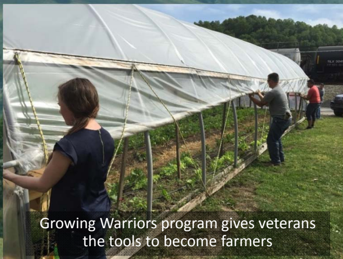
Growing Warriors program gives veterans the tools to become farmers