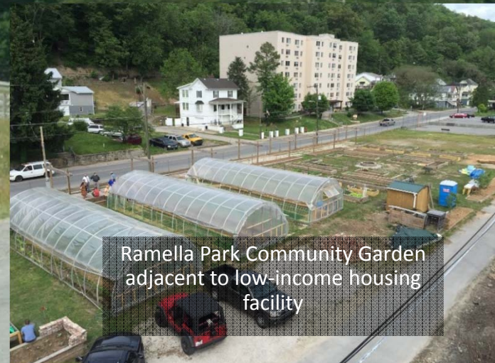
Ramella Park Community Garden adjacent to low-income housing facility