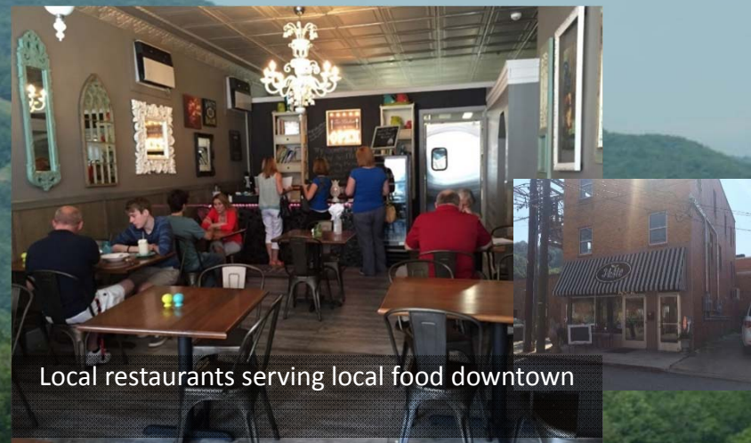
Local restaurants serving local food downtown