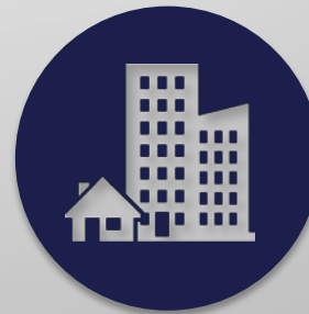
Property owners throughout Los Angeles County