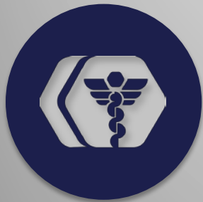
Los Angeles County Dept. of Health Services